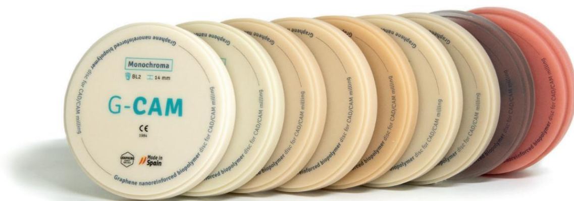
Fig. 3. Various available shades of the G-CAM disc